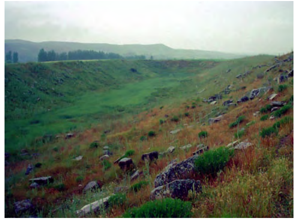
Stadium at Laodicea