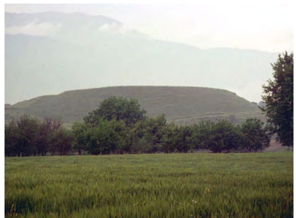
The Tell of Colosse