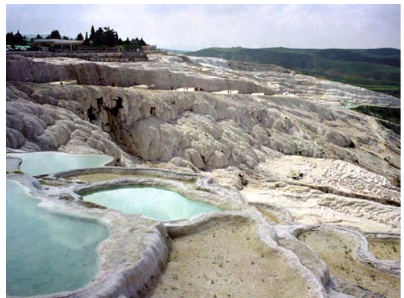
Calcium Terraces at Pamukkale