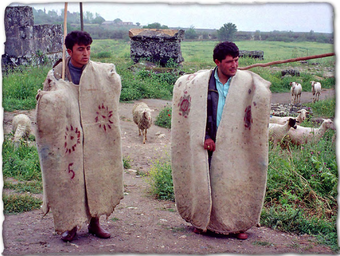
Shepherds At Hierapolis

“Epaphras, who is one of you... has a great zeal for you, and those who are in Laodicea, and those in Hierapolis... Now when this epistle is read among you, see that it is read also in the church of the Laodiceans, and that you likewise read the epistle from Laodicea” (Col. 4:12-13, 16)