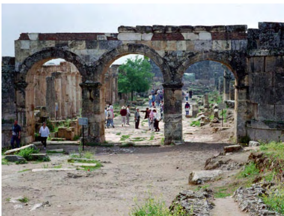
Domitian's Gate at Hierapolis