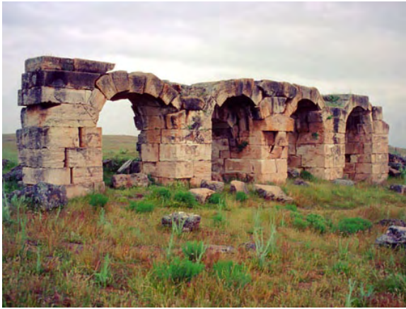
Bathhouse Arches at Laodicea