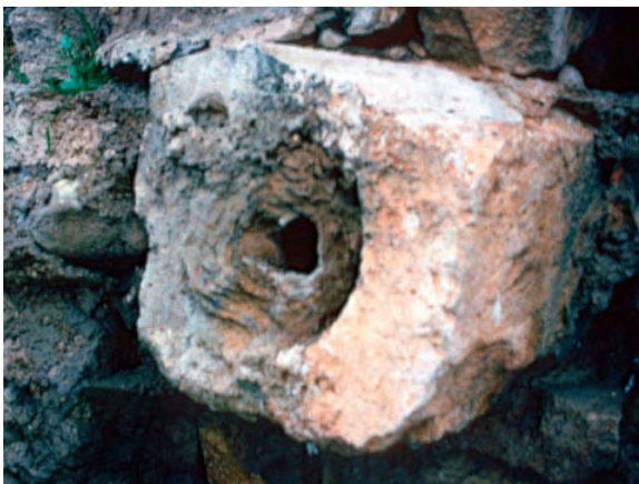
Water Pipes with Calcium at Laodicea